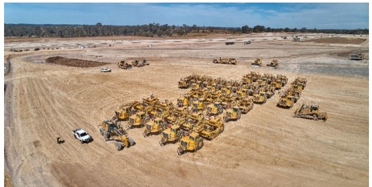
Early Earthworks plant fleet, September 2019

We are continuing to work closely with our neighbours as we deliver Early earthworks for Western Sydney International and will continue to update you as work progresses.