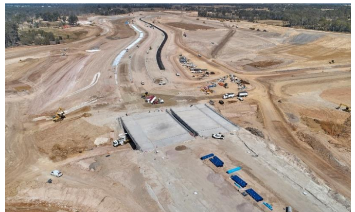
Badgerys Creek Road realignment, September 2019

We look forward to working closely with our neighbours as we work to deliver Early earthworks for Western Sydney International and will continue to update you as work progresses with the construction of the Airport.